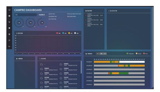
Campro IIOT Software