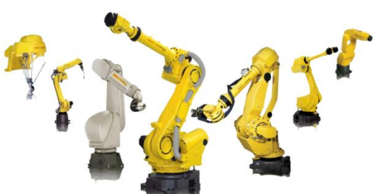
Fanuc Robotics Authorised System Integrator