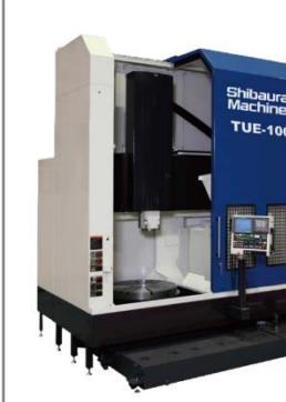
CNC Machine Tools