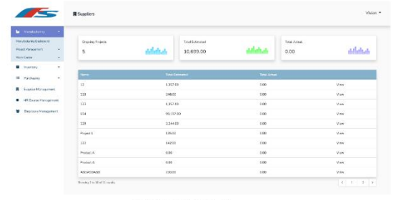
iSMART ERP Software