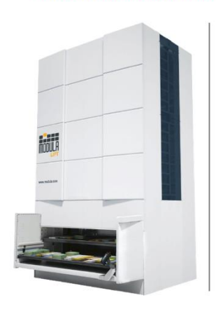
Vertical Storage System